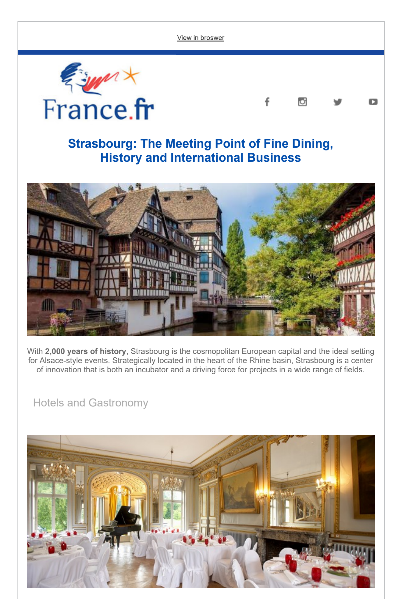
Extensive choice of accomodation for both budget conscious and high-end programs. 149 hotels with a total of 9,200 rooms including:

5 star hotels with meeting facilities (Hôtel Régent Petite France & Spa - 92 rooms; Sofitel Strasbourg Grande Île - 150 rooms; Château de l'Île - 62 rooms)