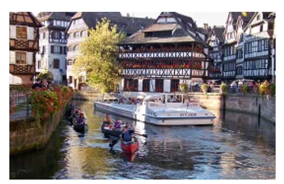
US Companies in Alsace

Given its strategic location, its cultural heritage and its remarkable architecture; Strasbourg attracts a large number of international organizations. These include over 350 American companies in Alsace such as Colombia Sportswear, DOW, Du Pont, Fossil, Johnson Controls Grand Est, Lilly, Mars Chocolate, Wrigley Mars and Quintiles Benefit.