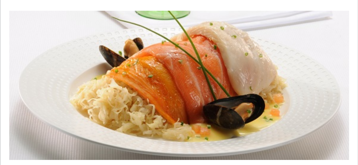
A region for Fine Dining with Renowned Cuisine and Wines

Overall in Strasbourg there are 10 hotels with 120 rooms. New openings are planned in the next 3 years for an extra 600 rooms in 4 star/5star properties