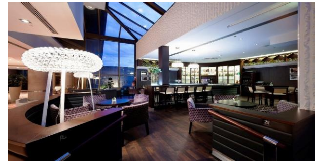
HBar & HBrasserie