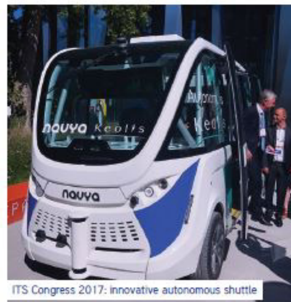
ITS Congress 2017: innovative autonomous shuttle