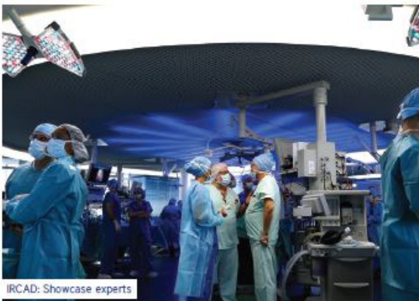
IRCAD: Showcase experts