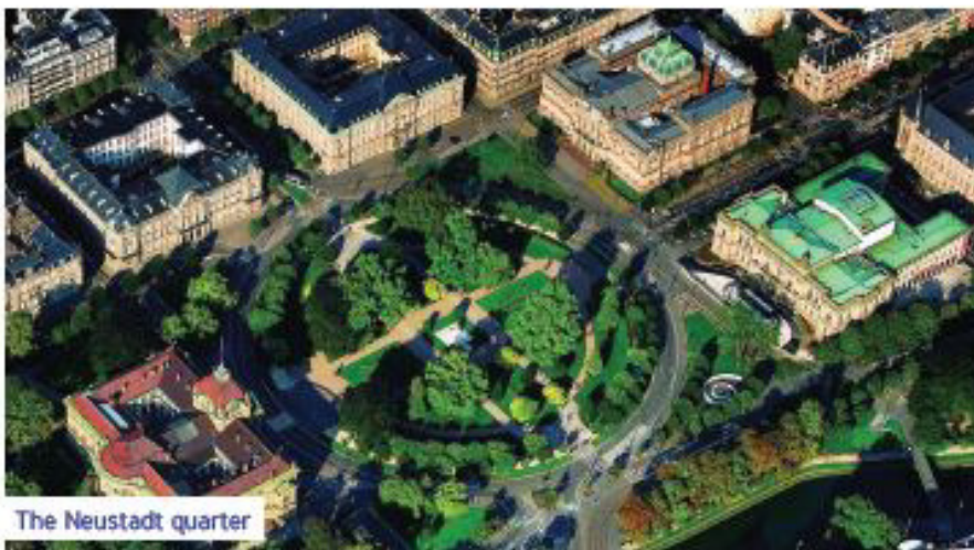
The Neustadt quarter

3 European Capital of democracy Strasbourg is home to the headquarters of the European Parliament, which can be visited, the European Council and more. It is the 2 nd most important diplomatic city in France, with 75 diplomatic missions and consulates.